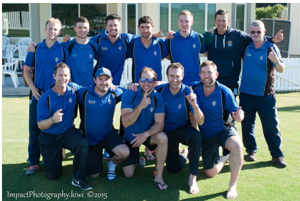
City Cricket Club Premier Men take out the NCA T20 competition

Finally we would like to wish all our club members and supporters as well as our invaluable and loyal sponsors a very Merry Christmas. We look forward to a positive new year, continued success both on and off the field. Happy holidays from the City Cricket Club Executive Committee.