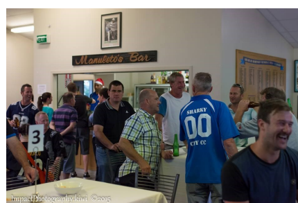
Enjoying refreshments around Manuleto's Bar