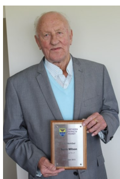
Man of the Moment!