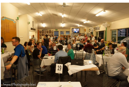
City Cricket Club Quiz Night gets underway!