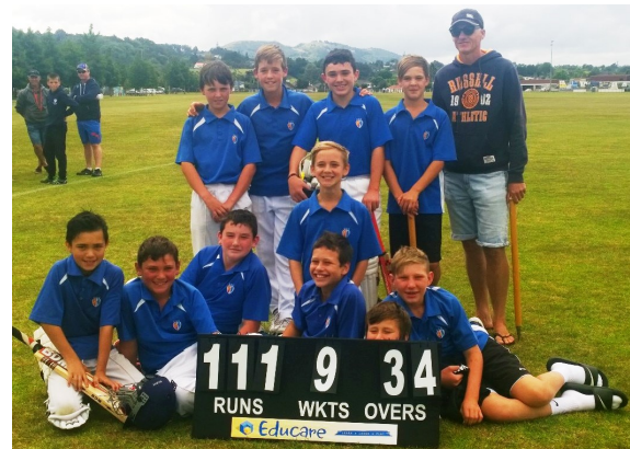
City Cricket Club Arrows take out the NCA A Grade competition